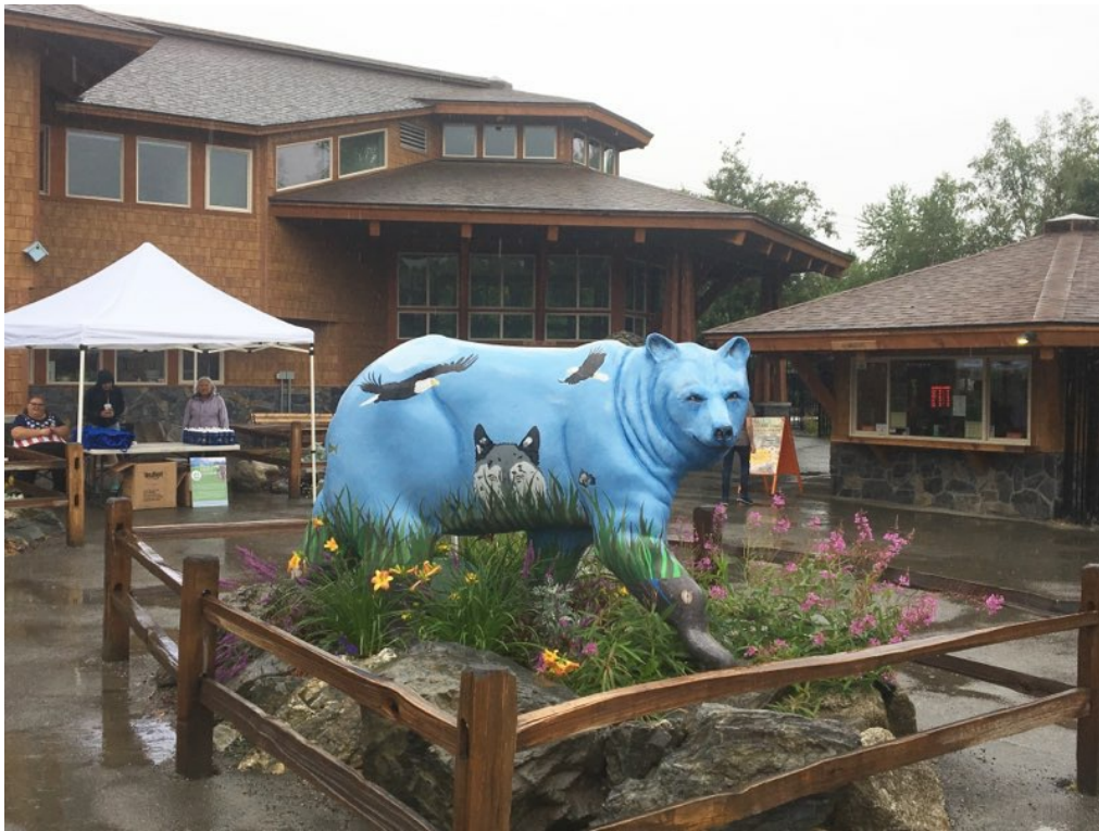
(Below) Stevens Foundation staff at the Alaska Zoo in Anchorage on July 27, 2019.

If you'd like to be involved in next year's events, please contact us.