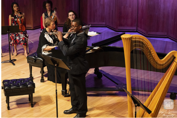
(Above) Anchorage Festival of Music Reunion Concert; Denys Symonette Photo.