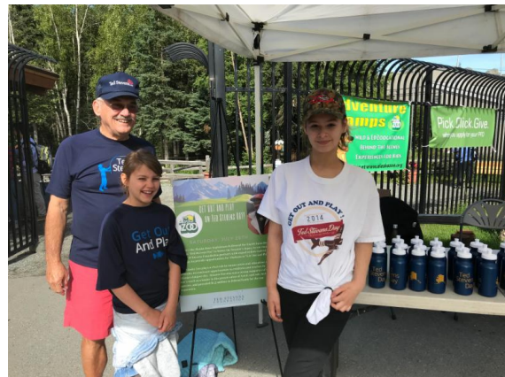
(Above) Alaska Zoo

Since 1999, the AFM has sponsored this annual award to support aspiring Alaskan musicians in their career development. To mark the 20th anniversary of this important scholarship program, and in recognition of Senator Stevens' strong advocacy for the arts and humanities, the AFM formally renamed the award the Ted Stevens Young Alaskan Artist Award .