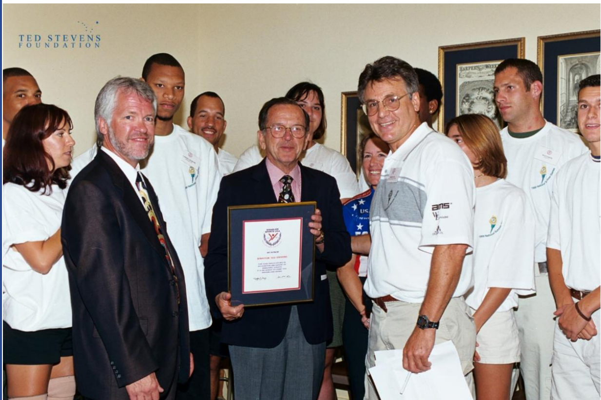
(Above) TS receives an award from USOC's Disabled Sports USA group honoring his recognition and support for Paralympic athletes in 1999.

-Senator Ted Stevens draft floor statement, 12 October 1978.