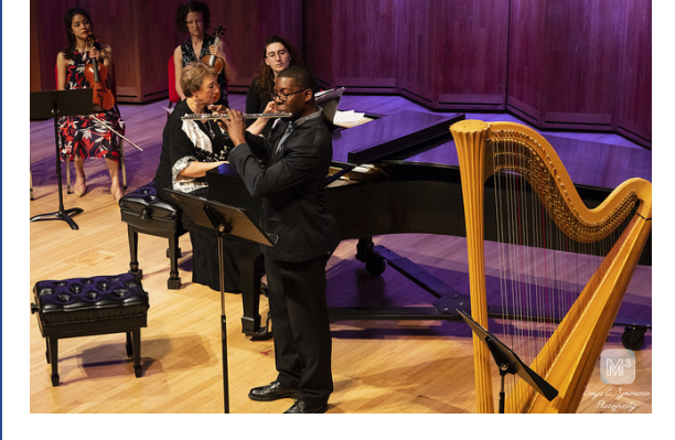
(Abov e) Anchorage Festiv al of Music Reunion Concert; Denys Symonette Photo.